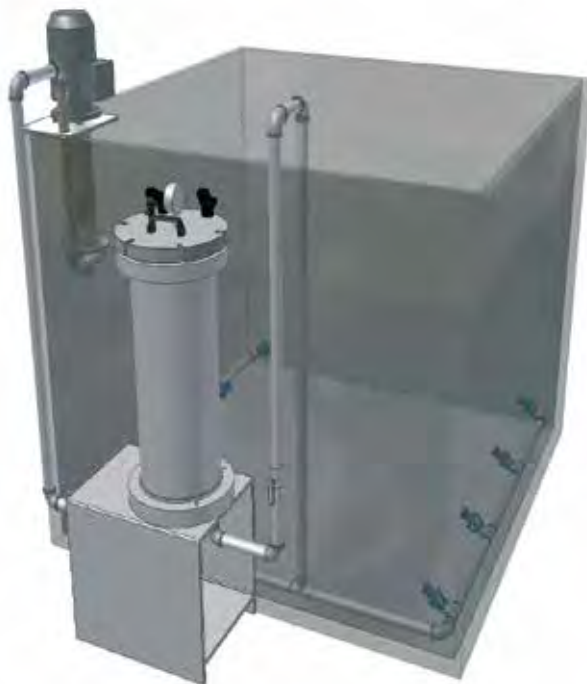
Filtering and agitation Standalone FT filter installed in series with CTV vertical pump and agitation nozzles. The CTV pump is strong and insensitive, making it ideal for installations in pre treatment baths where particles are present.