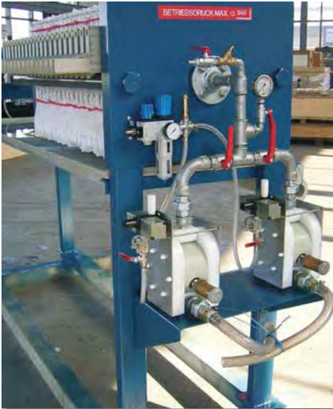
◀ Compact TF filterpress pumps installed for recovering solid waste from water