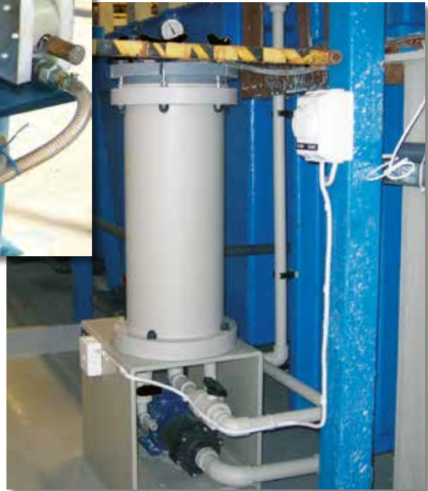
Filter FT and magdrive pump CTM used ▶ for circulation and filtering of surface treatment bath